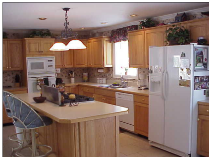
Bright kitchen, den, and family room with fireplace.