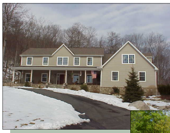
Nestled against park land on a private cul-de-sac.