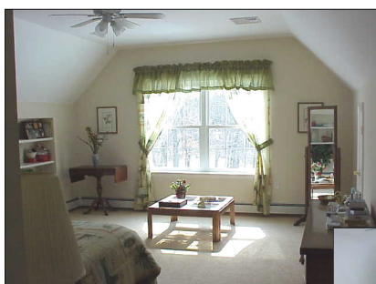
Several room master suite.