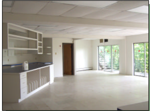
Bldg C has expansive open work space or eat in Kitchen with large sliding windows to decks in the trees, forest views. Round river stone roof for sunning & poss. solar!