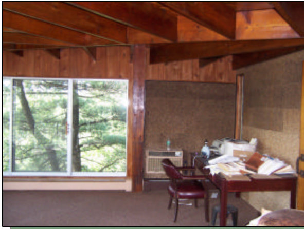
Building B has lake views and vaulted ceilings, cedar, cork walls, Oyster shell and plaster walls, local Stone, Sod roof.