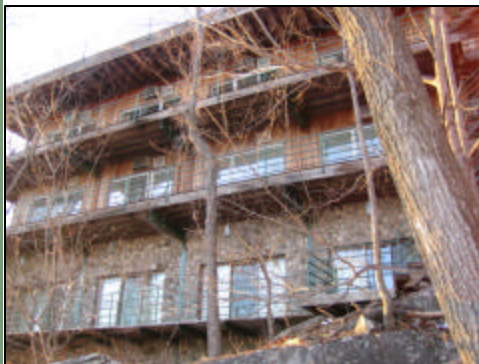
< 3 Private wooded lots &Koi pond and direct access to hike in Sterling Forest Parkland . Zoned as Business / Office Space yet possibly convertible to Residential zoning with possible rental units and/or home office with Town approvals.